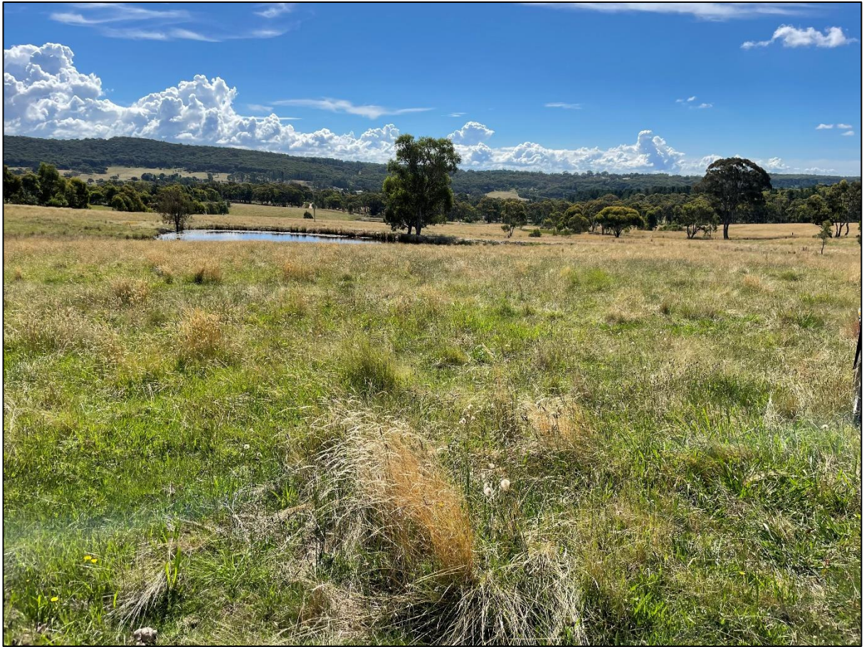
Looking west over the recommended application area